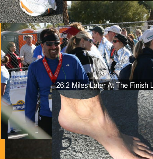
26.2 Miles Later At The Finish Line