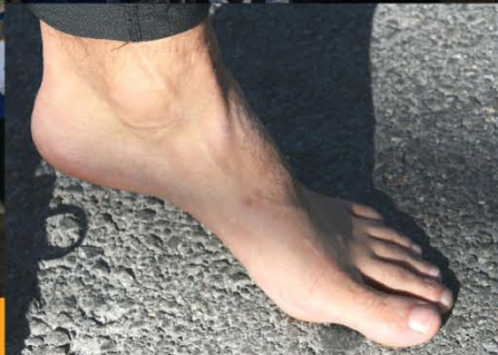
Dry Feet - No Blisters or Hot Spots!